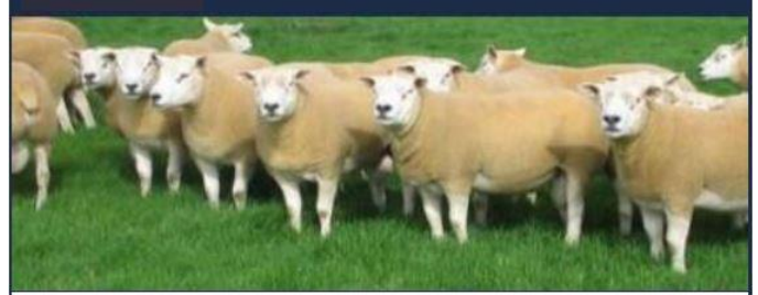
ANNUAL RAM SALE

WEDNESDAY 9<sup>TH</sup> SEPTEMBER AT 5:30PM