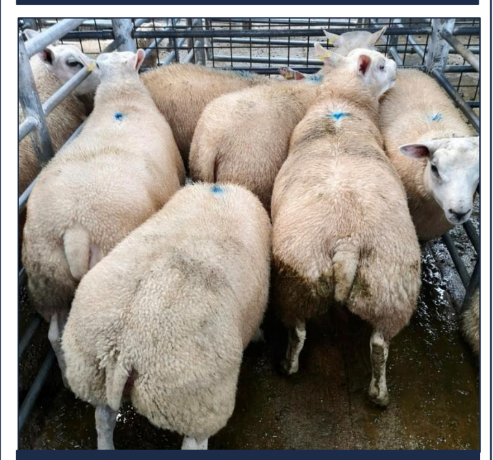
234P/KG FOR 41.5KG FROM GEORGE EVANS